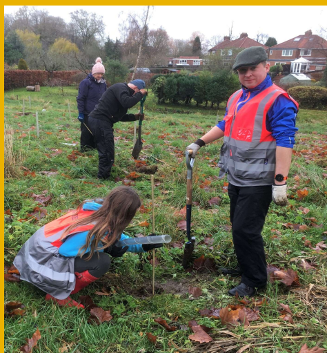
Rotary Tree Planting Project, on Haxby Road

The advice given to me was ...'take your time' as you can become if not careful overwhelmed with involvement in projects. Amazingly there is an enormous amount of Rotarian support to helping in the community. Since joining I have so far helped in the community at the annual York Marathon and tree planting on Haxby Road. Personally I have been on monthly walks as well as Friday morning visits into businesses. I particularly enjoy seeing behind the scenes and how things work!