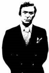
NOT A LOT OF PEOPLE KNOW THAT

There are 103 Rotary Clubs in Yorkshire/Lincolnshire district (3 in York!)