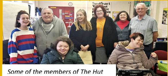
Some of the members of The Hut

The Hut York is a members-led charity based on Wigginton Road York. We provide services for those with learning disabilities and or/mental health issues. The Hut was established in 2011 by 3 psychiatric nurses who felt that there wasn't a dedicated safe space for those with mental health issues or learning disabilities to learn, grow, socialise and be themselves. Since then we have gone from strength to strength attracting members from across York and beyond. At present we have over 200 registered members. Although we focus on people with mental health and learning disabilities we are open to all offering a cup of coffee and a chat to anyone who visits us.