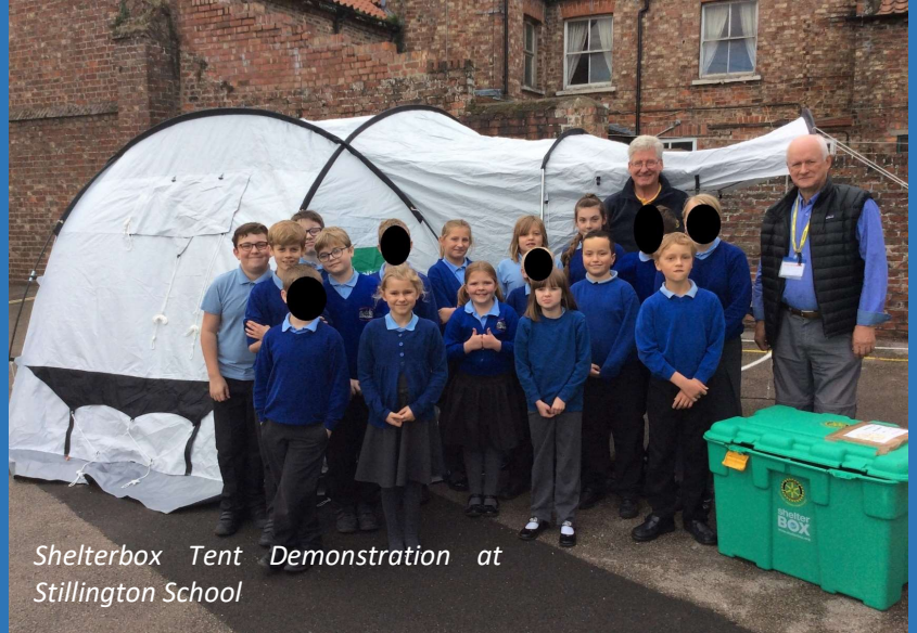
Shelterbox Tent Demonstration at Stillington School

A team from the Rotary Club of York have been demonstrating their relief ShelterBox to pupils at three primary schools in the York area. The idea was to raise awareness of the plight of thousands of families recently made homeless by devastating floods, hurricanes, landslides, volcanic eruptions or cyclones, and to encourage schools to consider raising funds for the charity.