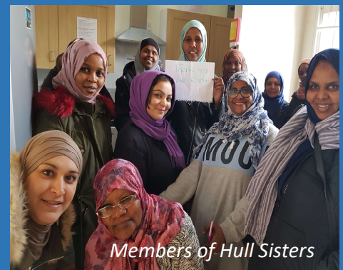
Members of Hull Sisters

We raised £700 at the lunch and have facilitated the start of a new Fund for Women and Girls. At the lunch our guests were asked to bring donations of women's sanitary items and toiletries and the Foundation has now delivered these to deserving women's groups such as Hull Sisters . One such group wrote "we just wanted you to know that all the women were very happy with the donation One woman said that I should pass her message onto you as only God can reward you for all you have done for us – we poor people can't"